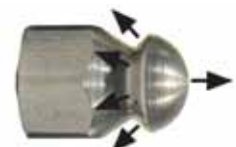
1-forward, 4 back ports