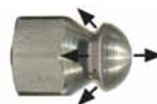
1-forward, 3 back ports