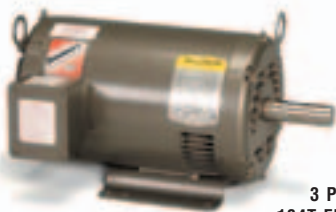
3 PHASE 184T FRAME