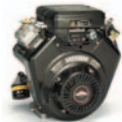
VANGUARD, V-TWIN OHV

Briggs & Stratton's top-of-the-line engines have proven performance in the pressure washer industry.