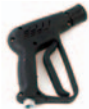
Iride Kew Style