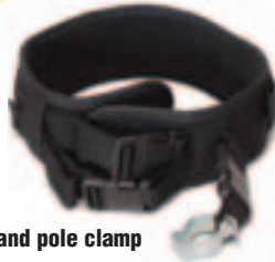
Belt and pole clamp

Extension Wand Control Kit below (Part No. 8.749-848.0) fits this lance.