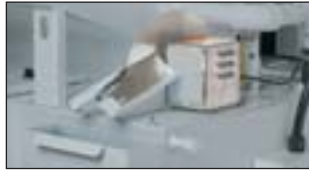
Integrated oil-skimmer helps remove oil from cleaning solution in reservoir.

Hotsy's internal roll-away door saves floor space and prevents wash water from dripping on the shop floor.