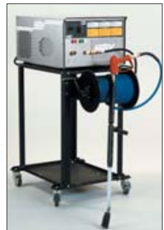
1700 Series shown with optional hose reel kit, (PN 8.903-039.0), cart (PN 8.903-037.0), caster wheel kit (PN 8.903-038.0) and stainless steel base and cover (PN 8.903-042.0).