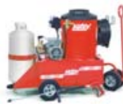
Model 771-Propane (Shown with optional Portagear & Propane Tank)