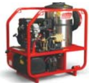
1080BE (Shown with optional stainless steel coil wrap and skid rails)

The belt-drive versions of the Gas Engine Series provide versatility with the roll cage design. Designed to fit the needs of the end-user, this versatile hot water washer converts easily to a skid unit, portable with wheels or a wheel/caster kit, or can be mounted on a trailer. Powered by reliable gasoline engines, the four models offer a broad range of cleaning power, from 3.0 to 4.6 GPM and from 3000 to 3500 PSI. All models are backed by Hotsy's 7-year pump warranty and all are ETL safety certified. All models are equipped with a standard pressure switch and 50' hose.