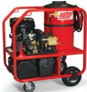
1075BE (Shown with optional caster wheel kit)