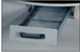
Easy access debris screen prevents foreign objects from falling into reservoir.

Hotsy's line of front-loading automatic parts washers gives you a choice of load capacities ranging from 500 lbs. to 2,500 lbs. and internal load heights from 30" to 60".