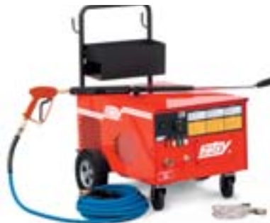
Model 1710 shown with optional wheel kit (PN 9.801-031.0).