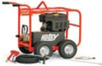
Hot- & Cold-Water Pressure Washers