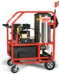
1270SS Shown with optional Portagear Kit