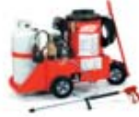
Model 558-Propane (Shown with optional Portagear & Propane Tank)