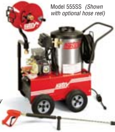
Model 555SS (Shown with optional hose reel)