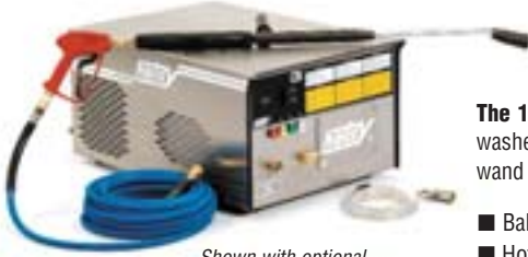
Shown with optional stainless steel cabinet