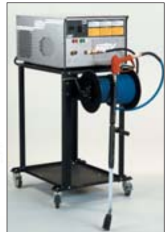
1700 Series shown with optional hose reel kit, (PN 8.903-039.0), cart (PN 8.903-037.0), caster wheel kit (PN 8.903-038.0) and stainless steel base and cover (PN 8.903-042.0).